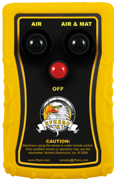
Internal Learn Button

Most RFHero Remotes Control Systems manufactured prior to January of 2019 will only have a learn/pairing button located INSIDE of the Receiver . If your Receiver has an external learn/pairing button, use the manual for pairing Systems built in 2019 .